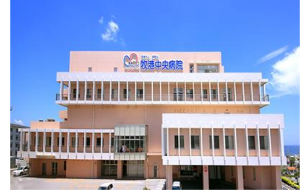
Makiminato Chuo Hospital (Cardiology)